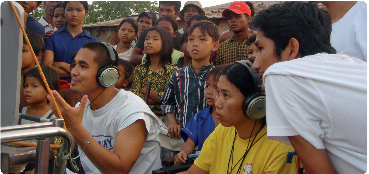
BBC MEDIA ACTION