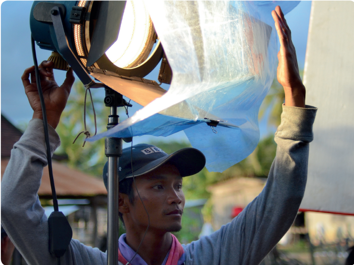
Left Filming the drama series, Loy9 Dream .

endemic from national through to commune level. Its pervasiveness is illustrated clearly by the extent to which people accept or tolerate corrupt practices, particularly when they are seen to improve efficiency or provide personal benefit. 15