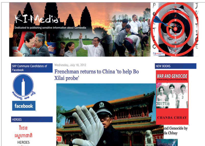
Below Independent Cambodian news site K-I-Media.

Local elections held in mid-2012 provide a snapshot of the Government's influence and, at times, overt control. In its report on the conduct of elections, the Committee for Free and Fair Elections in Cambodia (COMFREL) found that less airtime was being allocated to opposition parties than in previous elections, as well as overt support for the CPP (and criticism of the opposition) on private television stations. 43 An election day ban on the broadcast of US-produced content was, in effect, a ban on independent broadcasters, given that a number of these re-broadcast programmes were produced by Voice of America and Radio Free Asia. According to the Cambodian news blog K-I-Media, Ministry of Information official San Putheary confirmed that "we banned all stations that handle VOA and RFA programmes." K-I-Media also reported that the National Election Committee had been unaware of the ban. 44